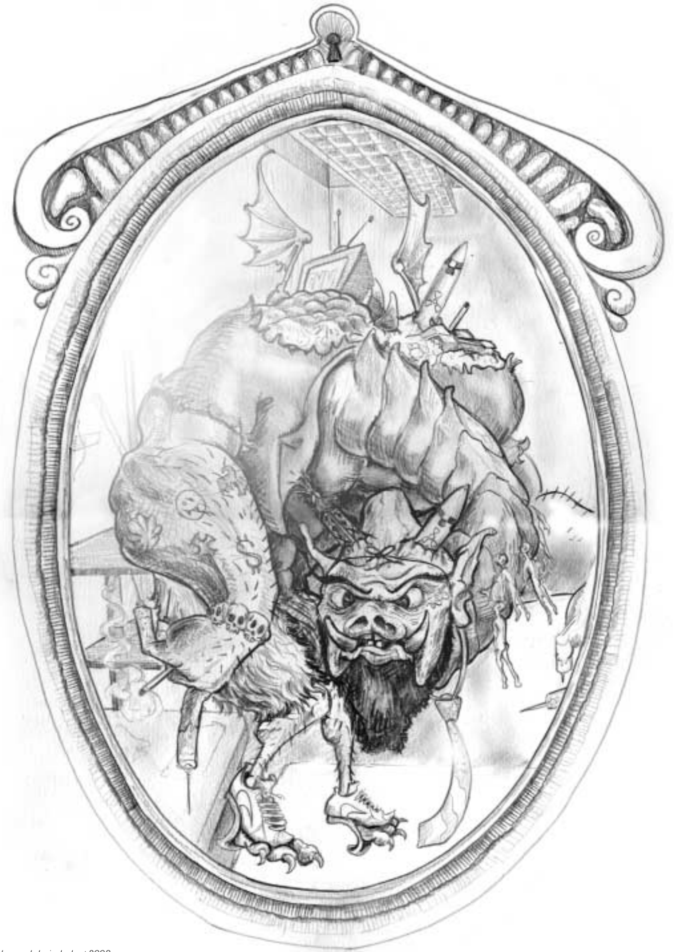
The Jabbercock by josh short 2003